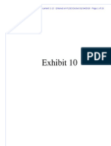
Exhibit 10 PDF