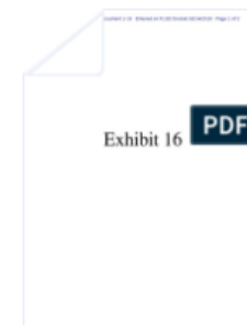
Exhibit 16 PDF