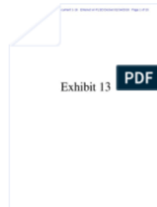
Exhibit 13 PDF