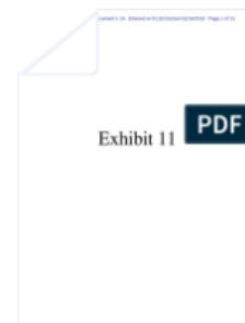
Exhibit 11 PDF