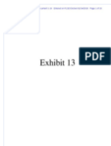
Exhibit 13 PDF