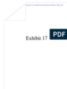
Exhibit 17 PDF