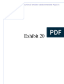
Exhibit 20 PDF