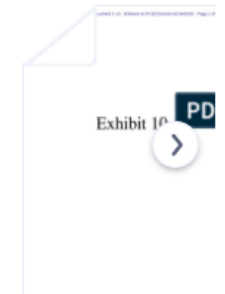
Exhibit 10 PD