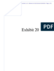
Exhibit 20 PDF