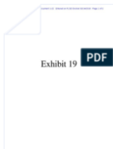
Exhibit 19 PDF