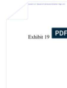
Exhibit 19 PDF