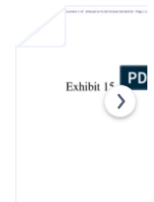
Exhibit 15 PD