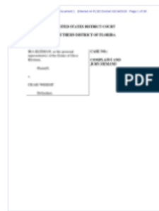
Bitcoin Lawsuit CARGADO POR Bitcoin Lawsuit