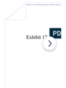
Exhibit 17 CARGADO POR Bitcoin Lawsuit