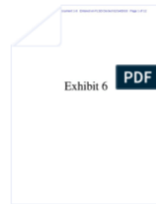
Exhibit 6 CARGADO POR Bitcoin Lawsuit