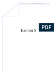
Exhibit 5 CARGADO POR Bitcoin Lawsuit