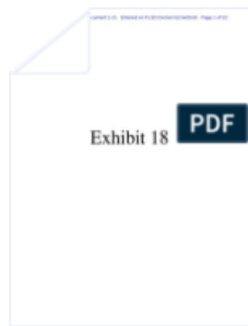
Exhibit 18 CARGADO POR Bitcoin Lawsuit